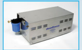
Coldblast 1 GPM Pump Module

COOLS TEMPERATURES UP TO 30° QUICKLY & EFFICIENTLY