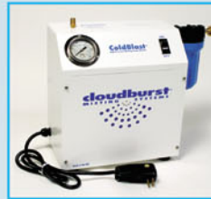
Coldblast .5 GPM Pump Module