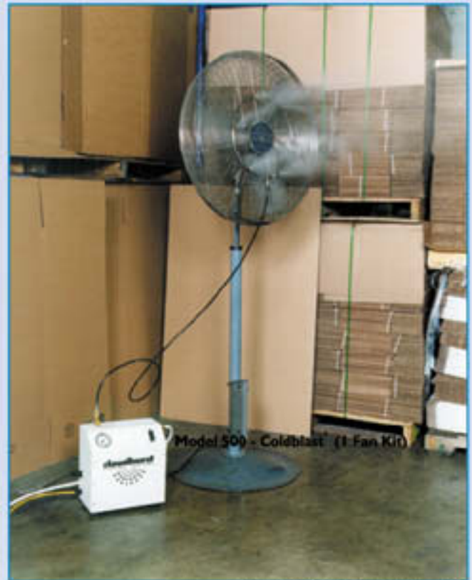
Model 500 - Coldblast® (1 Fan Kit)